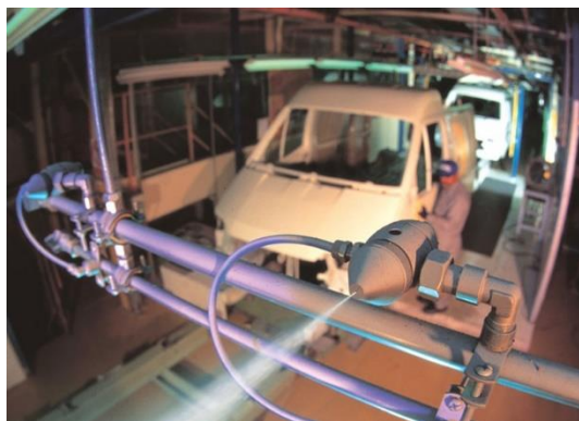
Industrial Process Humidification

Tekceleo's modular humidification system is not a final product, but a technical solution that can be tailored to your unique requirements. Choose Tekceleo for the ultimate in flexibility, reliability, and precision humidity control.