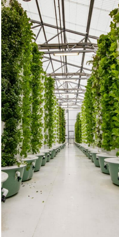
Controlled Environment Agriculture

Smart Choice for Humidification : Accuracy, Reliability, Simplicity